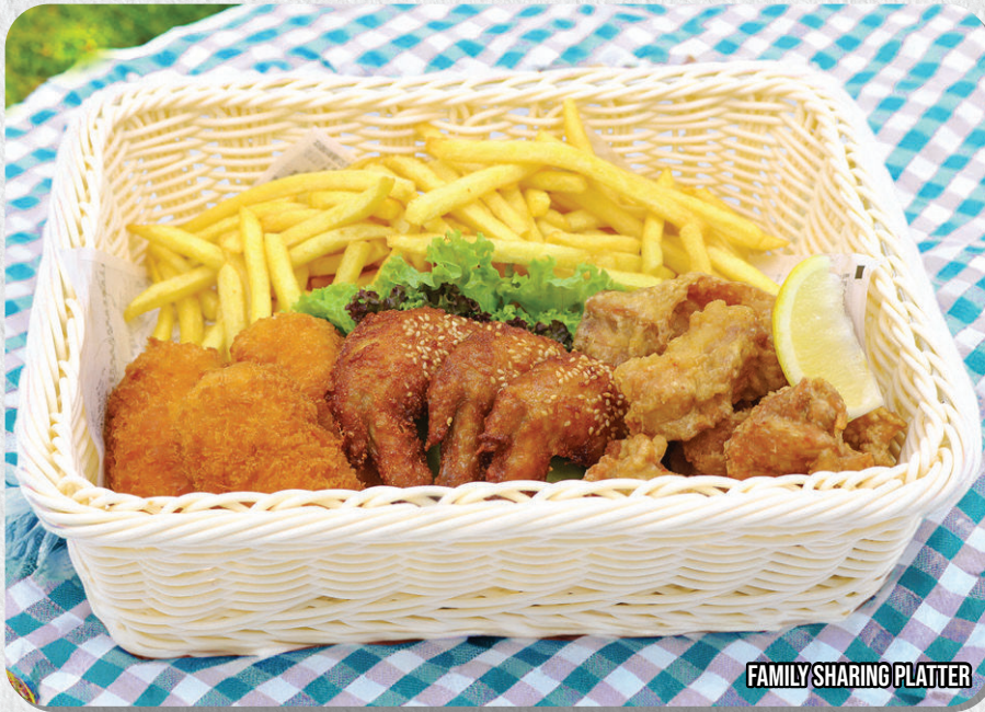
FAMILY SHARING PLATTER