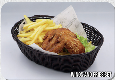
WINGS AND FRIES SET