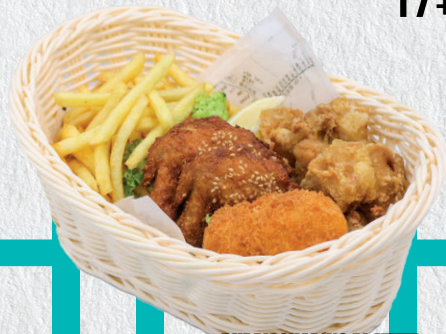
BUDDY SHARING PLATTER