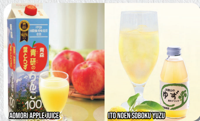
AOMORI APPLE JUICE