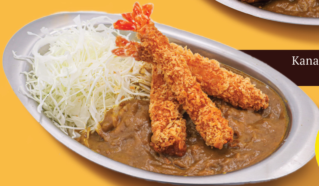
Kanazawa Curry (Ebi Fry)