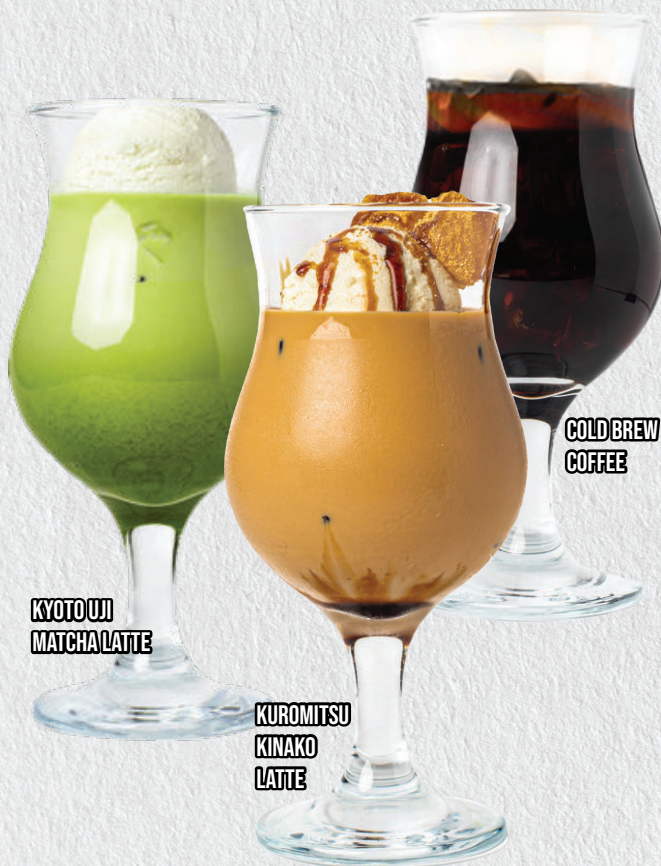
KYOTO UJI MATCHA LATTE