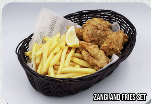
ZANGI AND FRIES SET