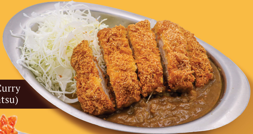
Kanazawa Curry (Chicken Katsu)